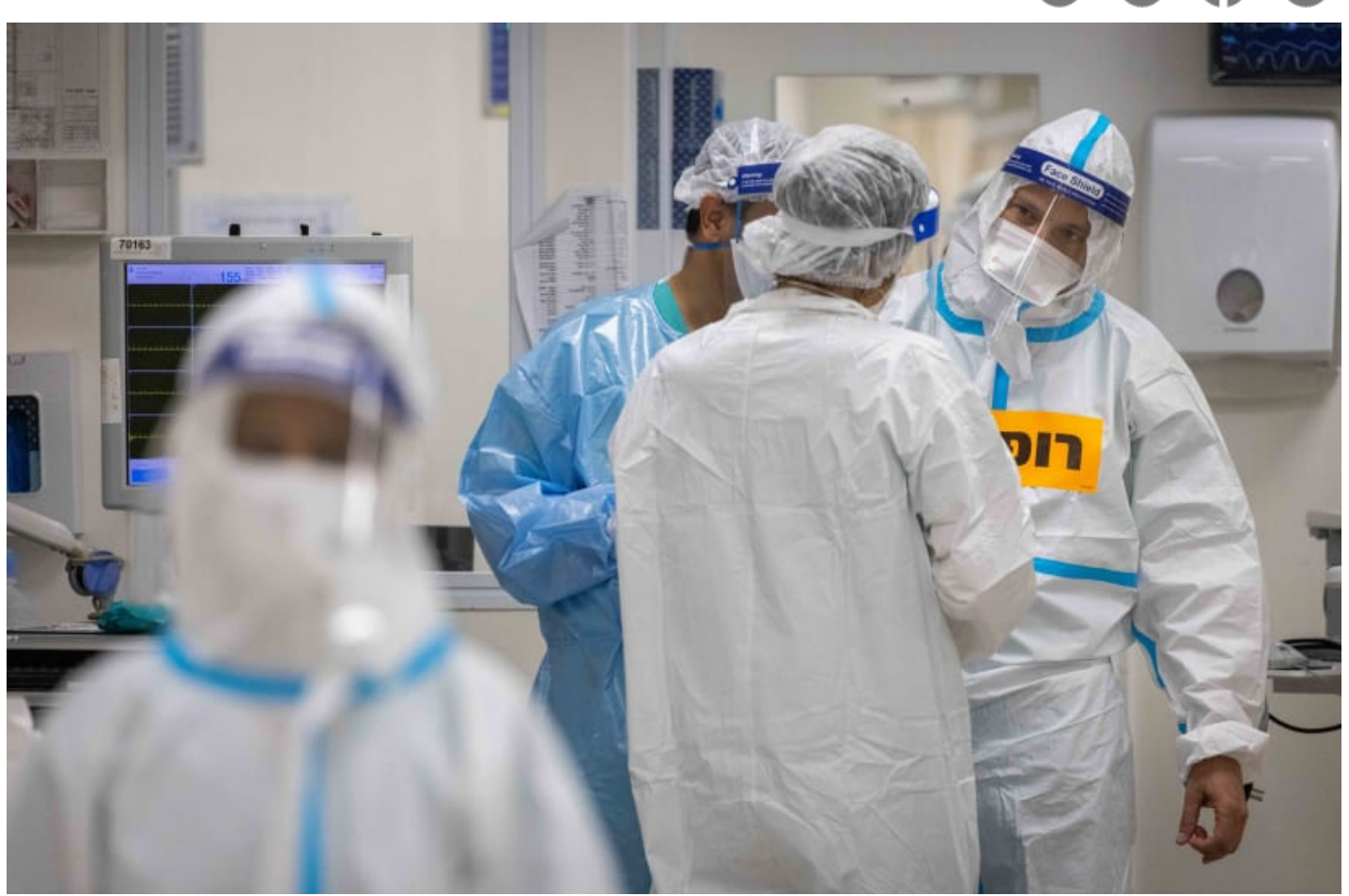
Shaare Zedek hospital team members wearing safety gear work in the Coronavirus ward of Shaare Zedek hospital in Jerusalem on September 23, 2021.