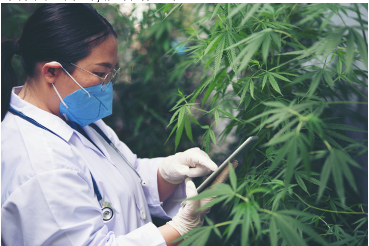
Cannabis Might Block COVID-19 Infection