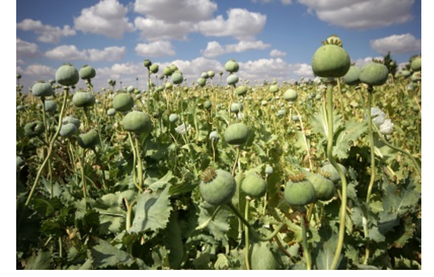
Three Plants that Could Replace Opioids: