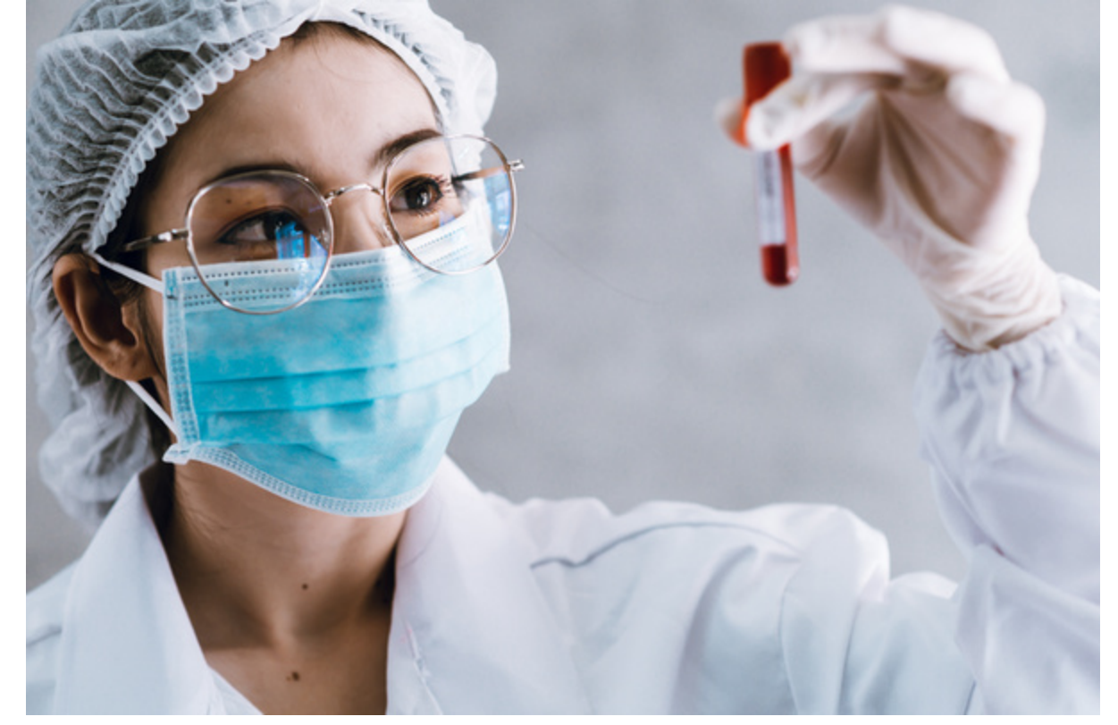
Vitamin D Deficient 10x More Likely to Die of COVID-19