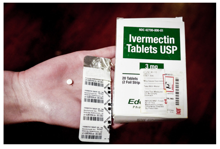
Ivermectin tablets packaged for human use.