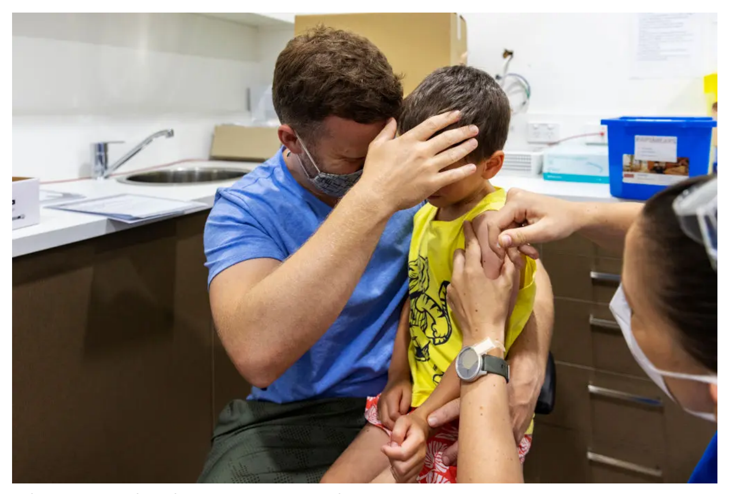
A father covers the face of his son as he receives a Pfizer COVID-19 vaccine in Balgowlah in Sydney, Australia, on Jan. 11, 2022.